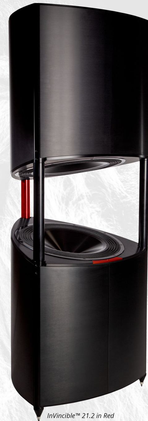
InVincible™ 21.2 in Red